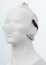
AirFit™ N20/For Her

F&P, Vitera, Evora, Simplus, and Eson are trademarks of Fisher & Paykel Healthcare Limited. For patent information, see www.fphcare.com/ip . All third party trademark and brand names are the property of their respective owners. All references to the company and product names used are for identification purposes only. 628435 REV A © 2022 Fisher & Paykel Healthcare Ltd