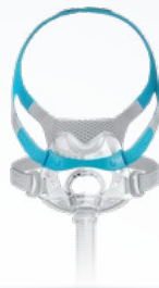
F&P Evora™ Full