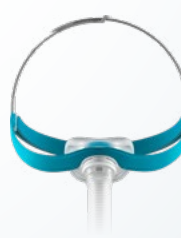
F&P Evora™ Nasal Under-the-nose