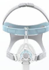
F&P Eson™ 2