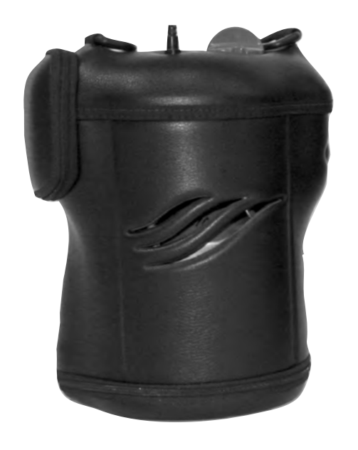
Spirit® 300 Shown

The Spirit® Portable provides an ambulatory source of oxygen for an extended period of time. You fill the Spirit® from a liquid oxygen stationary unit. The compact, lightweight Spirit® was developed to increase mobility and improve comfort of the typical supplemental oxygen patient.