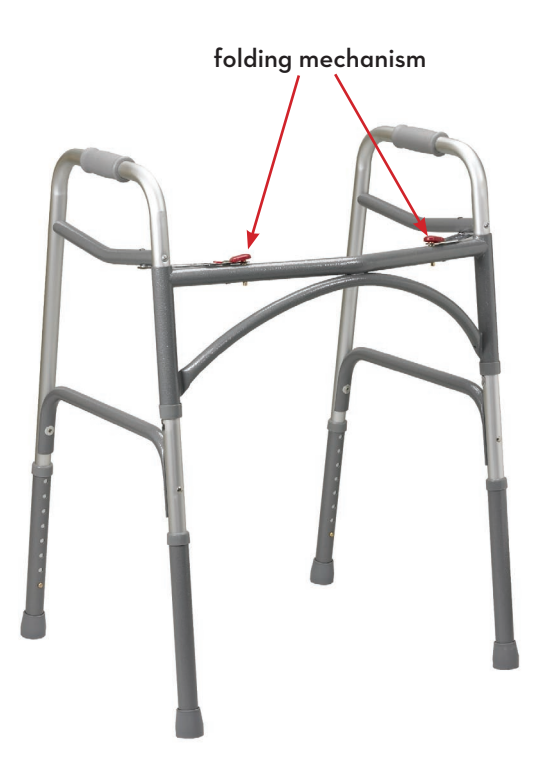
Image: Ref.10220-2 ShownFor use with allOversized Folding Walkers, Two Button